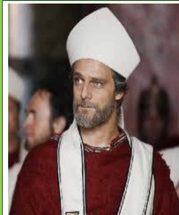
St. Augustine Feast Day