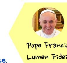
Pope Francis, Lumen Fidei

Faith does not merely gaze at Jesus, but sees things as Jesus himself sees them, with his own eyes: it is a participation in his way of seeing... christ's life, his way of knowing the Father and living in complete and constant relationship with him, opens up new and inviting vistas for human experience.