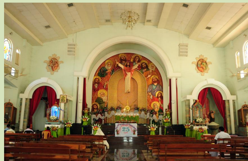
The Sanctuary of the Church