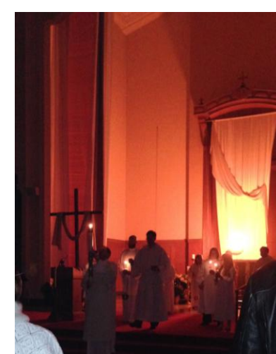
2015 Easter Vigil

Please turn in your Rice Bowl boxes in the basket on the registration table in the back of the church. Thank you for your generosity.