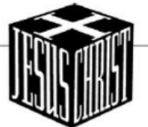
the stone that the builders rejected has become the corner stone ... Matthew 21:42

H W F K F X X L K S C J J T G A F A W F D Q L I E R L I M S R R Z L V P A I L R E A V K E V U H F L A L R L V J S U I Y E I S A Q R A P E A E T I A L S T O R F A N N D N C V G D R T W N M J B D L S T T H N E N T I M E O L O I L S E Z W X T M M G R U E W S E O D O U C E Z D L S R K N T U C T J E Z D B G U T N T E E O H D L Z Q I R U W G E Q R N C O L O X N S B A I D Y P W T R O Y Y T D E I W C L E J A J C V S Z D W N S T S S T W V I N E Y A R D T